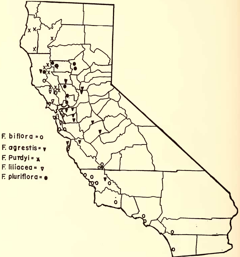
FIG. 2. Distribution of certain species of Fritillaria in California.

Bulb deep-seated, with stout scales; stem 30–50 cm. long; leaves on lower part of stem, alternate, crowded, oblong-oblanceolate to linear-lanceolate, 7.5–11.25 cm. long, 12–17 mm. wide;